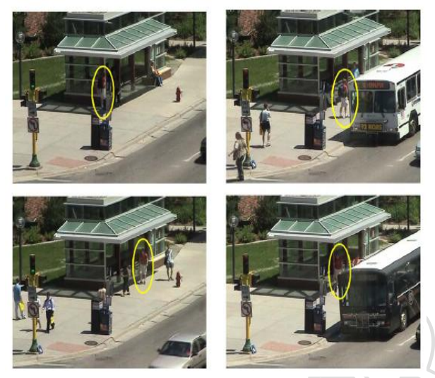
Fig 6: Sample single-person or no interaction behavior. Suspicious person (marked with an ellipse) loitering for a long period of time without leaving in a bus.

This behavior detection process consists of foreground segmentation, blob detection, and tracking. Semantic descriptions of suspicious human behaviors are defined through groups of low-level blob based events. For example, fights are defined as many blobs' centroid moving together, merging and splitting, and overall fast changes in the blobs' characteristics.