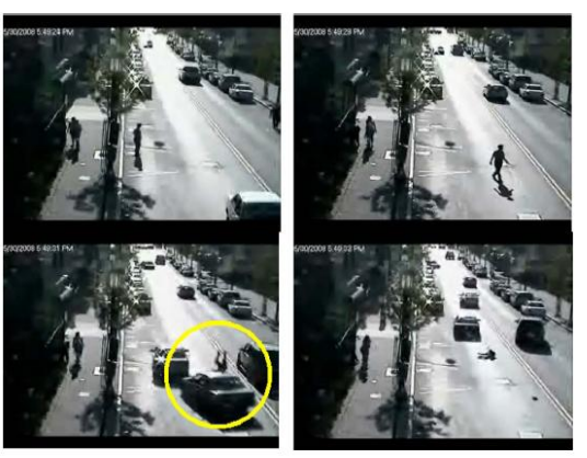
Fig8 : Person vehicle interaction

We propose a system To develop an Intelligent System for detecting, Modeling, Classification of human behavior using image processing and machine vision to detect abnormal malicious intents. We are aiming to develop a system that would not only do the work done by traditional surveillance system but also help observer in detecting behavior patterns. So we are trying to develop a software based on image and video processing algorithms that we help us detect and classify human behavior. As detecting a human behavior from a scene we need to follow some sequential steps in our processing of the video. Fig 10