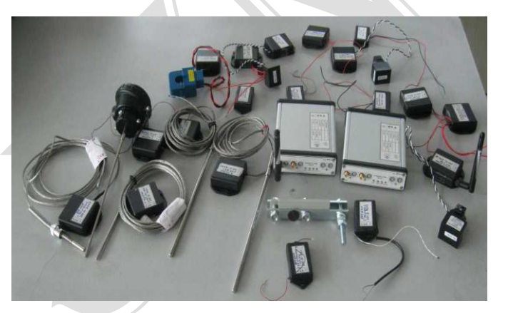
Fig. 1 RFID readers & different types of RFID tags

etc. Furthermore, RFID systems can discern many different tags located in the same area.