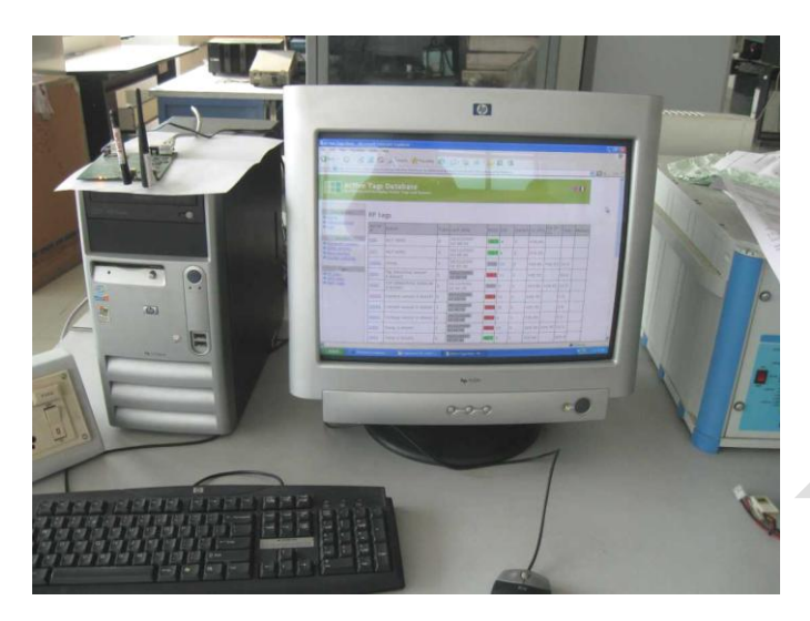
Fig. 3 RFID Reader with required software in computer for data acquisition

reader can communicate with a computer by variety of interfaces like RS232, USB, Ethernet, Bluetooth and GPRS. Fig. 3 shows an RFID reader with connected computer system for monitoring tags data.