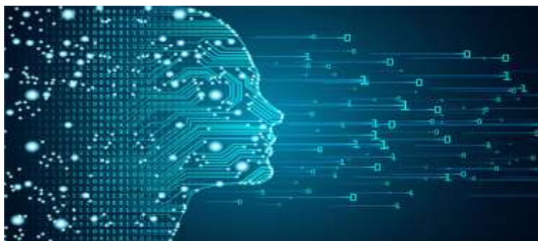
Figure: Intelligence Amplification