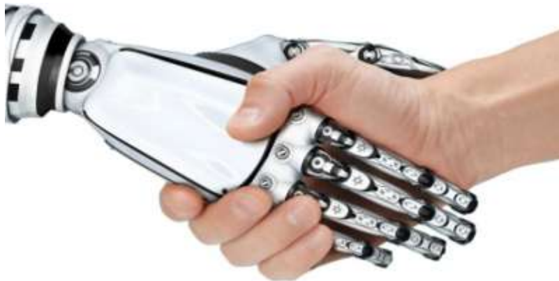
Figure: 2Day after Tomorrow

This technology allows software to “read” the emotions on a human face using advanced image processing or audio data processing. We are now at the point where we can capture “micro-expressions,” or subtle body language cues, and vocal intonation that betrays a person’s feelings.