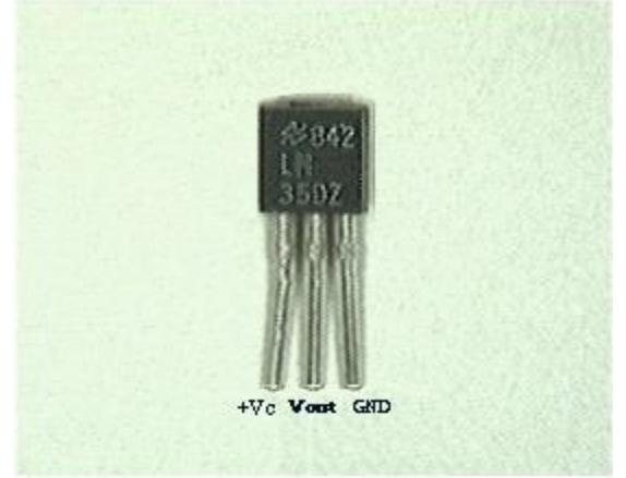
Figure (2) LM35 temperature sensor

The scale factor is .01V/°C. The LM35 does not require any external calibration or trimming and maintains an accuracy of +/- 0.4°C at room temperature and +/- 0.8°C over a range of 0°C to +100°C. [6]