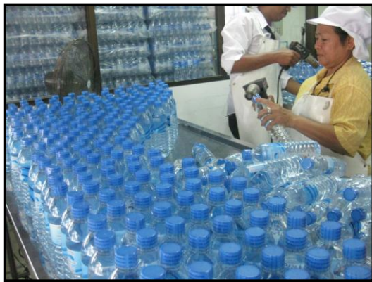
Fig. 8 Filling Activity.