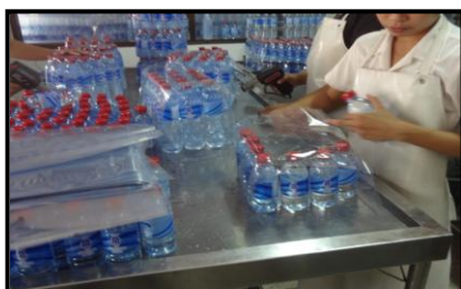
Fig. 9 Packaging Activity.