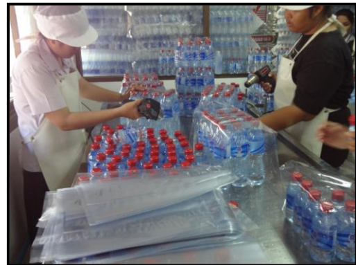
Fig. 10 Packaging Activity 600 ml.

The results had shown that new equipment, more efficient way of sharing the work.