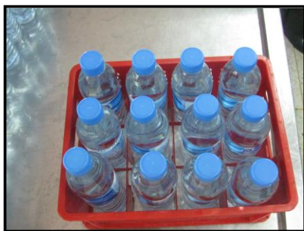
Fig. 6 Bottles on rack.

From the Fig. 5, we display the rack to help in placing process which the bottom of the rack is cut off after the operator close the lid, lock the bottle. The bottles will be put in the equipment by the operators instead of the old placing process. The new process will help the operators who are in charge off framing to easily put the film on the bottle without being confused. After the filming process, the operators could lift up rack out of the bottles transfer to the packaging process as following Fig. 6