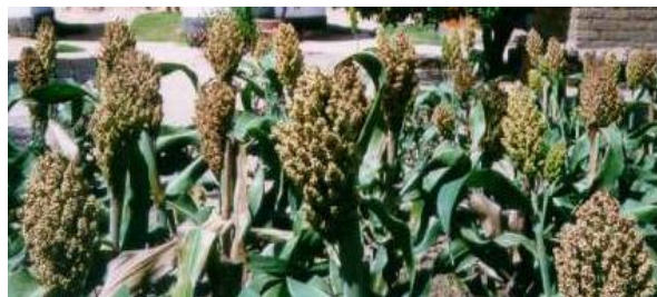
Fig. 1: Masakwa Sorghum plant

Sorghum ( Sorghum bicolor L. Moench ) is the fifth most important cereal crop in the world and second to maize in Africa (FAO, 1996). It is widely grown in the subtropics, tropics and Africa continent. Of all Sorghum cultivars available for cultivation by farmers “Masakwa” the Dry Season - Sorghum has occupied an important position for some time in the region. This cereal crop is grows very well on Vertisol (30 – 60% clay), heavy and light alluviums, red, gray, yellow loams and sandy soil (Pannar - Seed, 2008). However, the crop is adapted to a wide range of soils provided its fertility is reasonable. Good yield may also be derived on soils with a pH of 4.5 – 7.5 and it can withstand a certain amount of salinity (Pannar - Seed, 2008). This variety of sorghum (Fig. 1) is a short day, low temperature (15 – 30 °C) and cold night cultivator. It is grown during the dry and cold harmattan period.