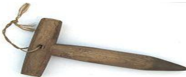
Fig 2: A Dibble

However, the major problem that could be identified in Masakwa production process are: low output due to the use of strenuous traditional tool, extension of transplanting period due to complete absence of modern machinery, non-uniformity of transplanting depth and plant spacing, and lack of water due to the proximity of the farm land to source of water.