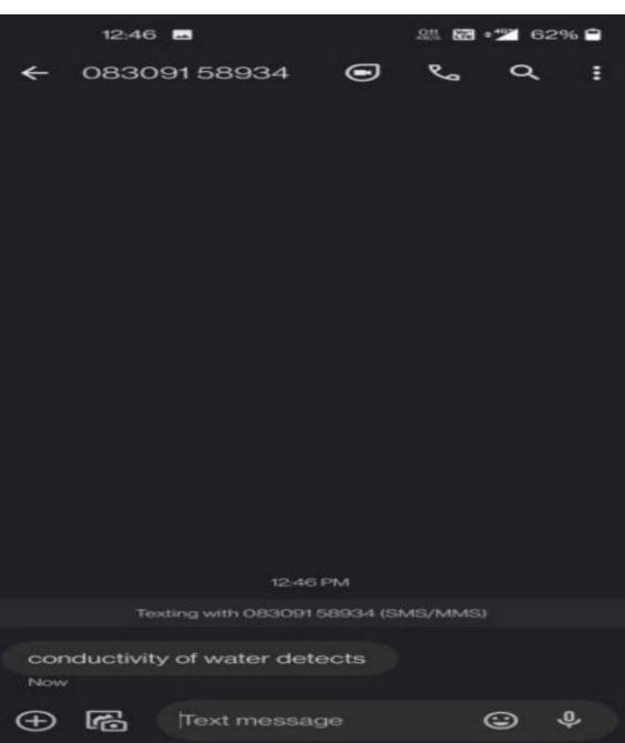
Description: If conductivity exceeds threshold