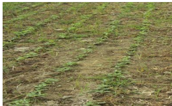
(b) Zero tillage system