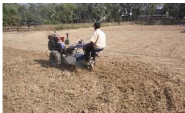
(a) The conventional method of planting

Land preparation was not required for the establishment of mungbean under zero tillage system. However, land preparation was a precondition for the cultivation of mungbean in the conventional method. The land was Ploughed by 3 passes of power tiller followed by 2 passes of laddering with straight alternation pattern. Land size of 11.20 decimals with 3 replication plots for each cultivation method was prepared.