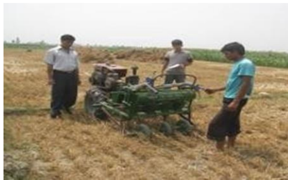
(a) Zero tillage system of planting

During mungbean planting time, the average moisture content of the soil for the top 50 mm was 25% (dry basis). In the case of zero tillage system, the seed was applied in an untilled previously harvested rice field. Straight alternation pattern was used for sowing. For proper seed placement, the speed of operation was maintained at 2.5 km/hr. In the conventional system, both seed and fertilizer were sown by manual broadcasting after the second pass of ploughing followed by laddering. After sowing/planting operation, all the cultural practices such as fertilizer application, irrigation and plant protection were done in all the plots as per the agronomical requirement. A photographic view of mungbean establishment using a zero-till drill and conventional method were shown in Fig. 2.