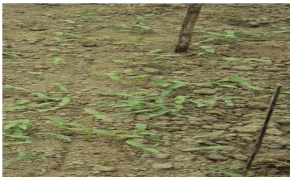
(a) Conventional method

Field performance of zero-till drill and conventional method for the establishment of mungbean was evaluated based on seed rate, a line to line spacing and depth of planting. Parameters related to field performance of zero- till drill and conventional methods are shown in Table 2. From Table 2, it is observed that applied seed rate was 30.0 kg/ha in the zero-tillage system and 35.5 kg/ha in the conventional method. Therefore, zero tillage system required 5.5 kg less seed per hectare compare to the conventional system. Besides, a line to line space was 20 cm and the average width of opening slits was 2.0-3.0 cm and depth of planting was 3.0-3.5 cm in zero tillage system. The adjustment of row spacing between two successive passes was maintained by operator skill and experience. However, seed spacing and depth of seeding were found uneven in the conventional method which is due to broadcasting and laddering.