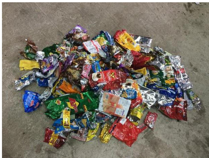
Figure 1 - Image of sorted packages.

The collection of post-consumer BOPP waste occurs at the Univalle cooperative, located in Novo Hamburgo in Brazil. Through sorting, only metallic BOPP packages selected, which were being deposited in a barrel as the conveyor moved and this collection took place, we carried out the group, together with the cooperative employees and with the necessary PPE's. The collection also took place at Escola Planalto Canoense, in the city of Canoas in Brazil, collected by students from the 3rd and 4th grades of elementary school, the purpose of compiling in schools is to raise the awareness of children and students. These separate supplies placed in bags for storage, presented in Figure 1.