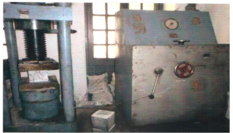
Compression Testing Machine (200 tonne)

Test : Compressive strength test is initial step of testing concrete because the concrete is primarily meant to withstand compressive strengths. Compressive strength test were carried out on 150mmx 150mmx150mm cubes with compression testing machine of 2000 kN capacity. The specimen after removal from the curing were cleaned and properly dried. The strength of concrete curved by immersion curing. membrane curing were calculated for 7,14 and 28 days. The strength of concrete for steam curing is calculated for 6 hours. The strength obtained is compared in a table.